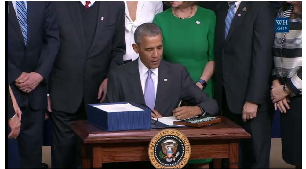
President Obama Delivers Remarks and Signs the 21st Century Cures Act